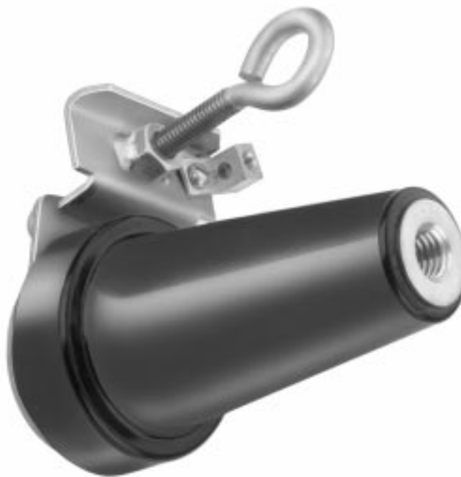
Figure 1. Insulated Standoff Bushing with mounting bracket, eyebolt and grounding lug.

A hotstick tool is used to place the standoff bushing in the parking stand on the front plate of the apparatus. Special tools are required to thread de-energized 600 A connectors onto the standoff bushing.