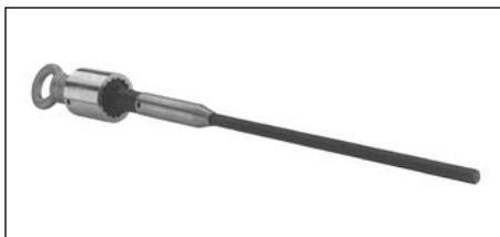
Figure 10. Catalog Number TQHD635 The Installation Torque Tool is required to ensure proper torque when installing a 35 kV Class bushing adapter to a 600 A bushing interface. It is precision calibrated and shotgun stick operable.