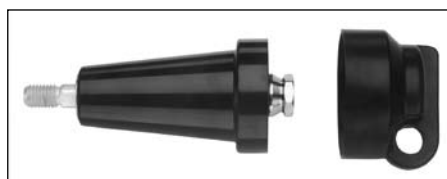
Figure 2. Insulating Plug with EPDM rubber cap.

Semiconducting peroxide cured EPDM Rubber Cap fits over the test point for a waterproof seal and deadfront shielding.