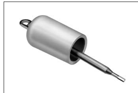
Figure 12. Catalog Number OT635 The Operating and Testing Tool is used with a hotstick to test for circuit de-energization and to install and remove a 35 kV Class LRTP equipped connector from an apparatus tap. The standard tool is equipped with a molded EPDM rubber cap to ensure tool seating.