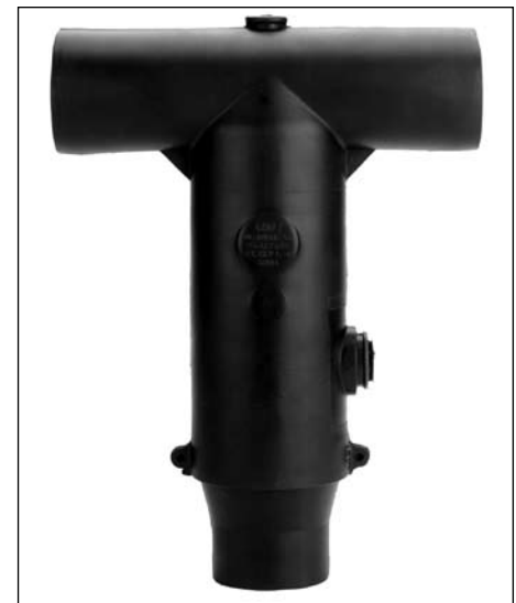
Figure 8. Molded Rubber T-Body.

Molded T-Body adapts to all cable sizes and provides a deadfront shielded connection.