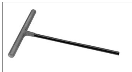
Figure 11. Catalog Number TWRENCH The T-Wrench is used to remove the alignment tool from the LRTP after assembly into a compression connector.

* Stud comes loose in kit, add "P" to part number for factory installation.