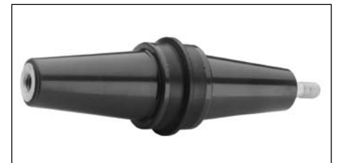
Figure 3. Connecting Plug shown with stud.

Versatile design can be used for connecting two or more 600 A deadbreak connectors or, with a bushing extender, to ease cable training by increasing the distance between an apparatus front plate and 600 A connector.