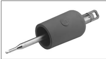
Figure 9. Catalog Number OTTQ635 The combination Operating and Test/Torque Tool is used with a hotstick to test for circuit de-energization and to install and remove a 35 kV Class LRTP equipped connector from an apparatus tap. The standard tool is equipped with a molded EPDM rubber cap and torque limiter to allow proper tool seating and gripping of the T-OP II Connector. It also ensures that the connector has been properly torqued into the mating bushing.

To order Cooper Power Systems 600 A, 35 kV Class Deadbreak Tools Accessories, refer to Table 6.