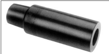
Figure 6. Cable Adapter.

Molded cable adapter is available in sizes to fit cables from 0.875" to 1.965" in diameter (22.2 to 49.9 mm). Molded of high quality peroxide cured insulation and semiconductive rubber to provide stress relief for terminated cable. Refer to Table 5.