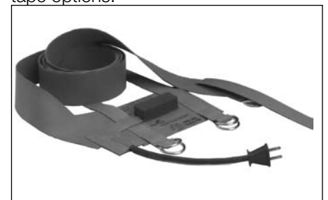
Figure 4. HT120 Cable Training Tool.

The HT120 cable training tool warms cable insulation, making it pliable and easily trainable. The tool is used for training cable in switchgear, vaults or on riser poles. It is available in 1, 2 or 3 tape options.