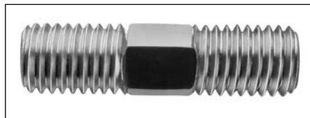
Figure 1. Threaded Stud made of aluminum or optional copper.

The threaded stud is used to connect reducing well plugs, deadbreak tap plugs, connecting plugs, and insulating plugs to other components or to apparatus bushings.